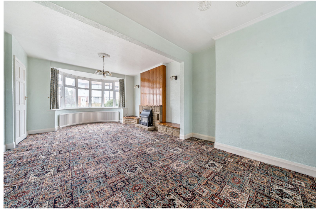
Shottery Avenue, Braunstone Town